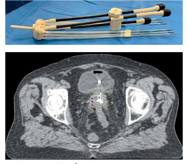
Fig. 1. Utrecht (Elekta®) applicator

Brachytherapy modalities and dosimetric data are demonstrated in Table 2. Brachytherapy target volumes included residual gross tumor volume (GTV), high-risk clinical target volume (HR-CTV, with GTV and the residual cervix), and intermediate-risk clinical target volume (IR-CTV), including HR-CTV, plus a 5-10 mm margin and the initial tumor extension). The HR-CTV was small, less than 17 cc, except for one patient (35 cc). The mean HR-CTV D<sub>90</sub> was 81.2 Gy (> 80 Gy in all but one), with a minimal dose of 64 Gy to IR-CTV D<sub>90</sub>. The dose constraints to OARs were respected; however, with a high D<sub>2cc</sub> dose to the bladder (89 Gy EQD<sub>2</sub>) for the patient with the highest HR-CTV volume.